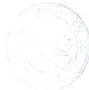
MANAGER CHAVARA HILLS CMI PUBLIC SCHOOL KURIANAD P.O., KOTTAYAM (DIST.) KERALA - 686 636